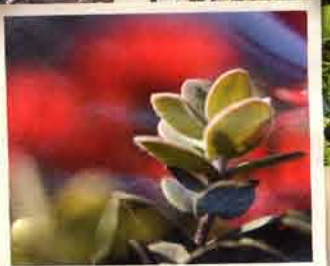
So many small wonders

Experience the Big Island's grandeur on a private Photo Ecotour with Photo Safari Hawai'i ( photosafarihawaii.com ). The company will pick you up in a luxury 4x4 SUV and drive you to the island's most scenic locations. The guides will share photography tips and insights along with the island's geographic and cultural history. You can even create your own fine art photography project with knowledge you've gained on the tour. Tours range from a half day to two days in length.