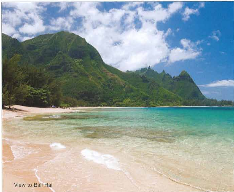
View to Bali Hai

Kauai Visitors Bureau . www.kauaidiscovery.com